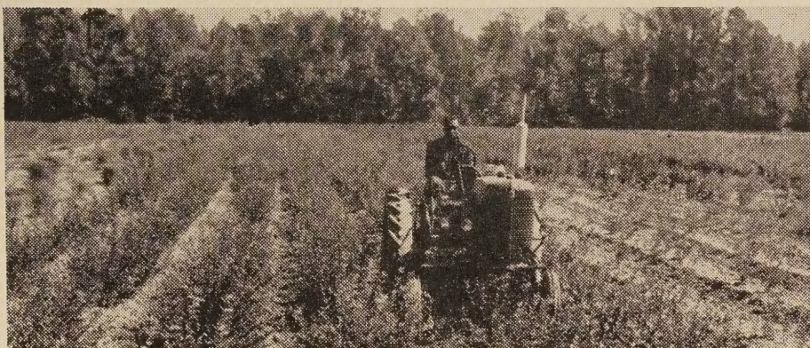
EUONYMUS carrieri or patens